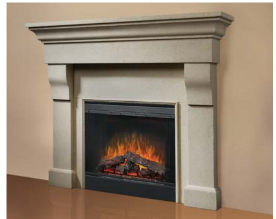
Stone-look mantel (BM39-STN) and BF39DXP firebox.

Specifications, finishes and dimensions are subject to change. Details given should be taken as a guide only. Protected by one or more of the following U.S. Patents: 6,050,011, 6,269,567, 6,190,019, 6,564,485, 5,642,580, 6,615,519, 6,363,636, 6,047,489, 6,718,665, 6,350,498, 6,162,047, 6,385,881 and Canadian Patents: 2,175,442, 2,310,367, 2,310,073, 2,204,106, 2,310,362, 2,310,414, 2,262,338. Other patents pending.