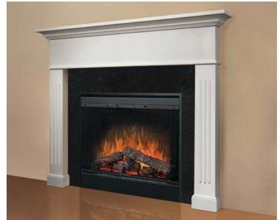
Pre-primed MDF mantel with black granite-look surround (BM39-BG) and BF39DXP firebox.