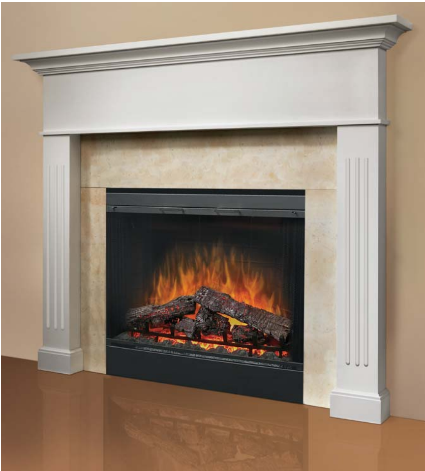
Pre-primed MDF mantel with cream marble-look surround (BM39-CM) and BF39DXP firebox.