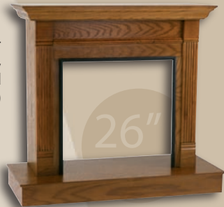
Traditional - 26" Wall Mantel, Oak Stained (CMA204FA)