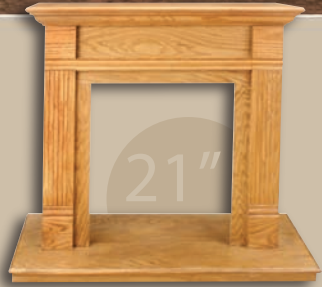
Traditional - Single Molding 21" Wall Mantel, Light Oak Stained (W21AOSA)