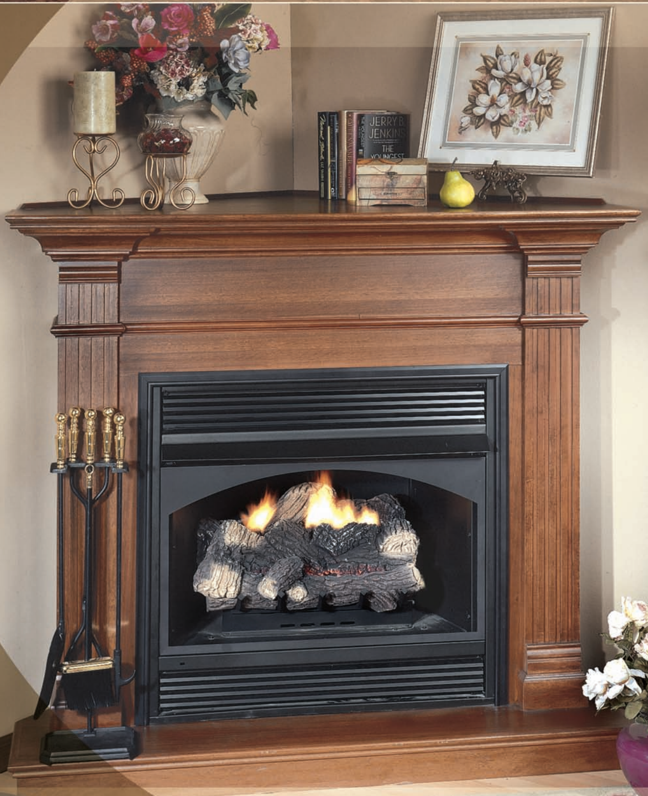
Wall & Corner Cabinet Mantels for Gas & Electric Fireplaces