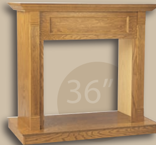
Traditional - Picture Frame 36" Wall Mantel, Light Oak Stained (GMC55FA)