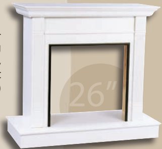
Traditional - Single Molding 26" Wall Mantel, White Paint (CMA210W)