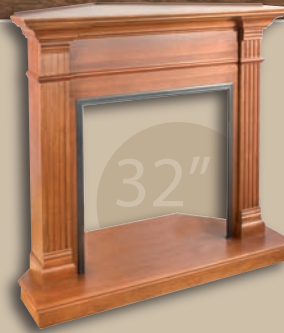
Classic - 32" Corner Mantel, Dark Oak Stained (C32HSA)