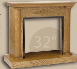
Georgian - 32" Wall Mantel, Light Oak Stained (GMC90FA)